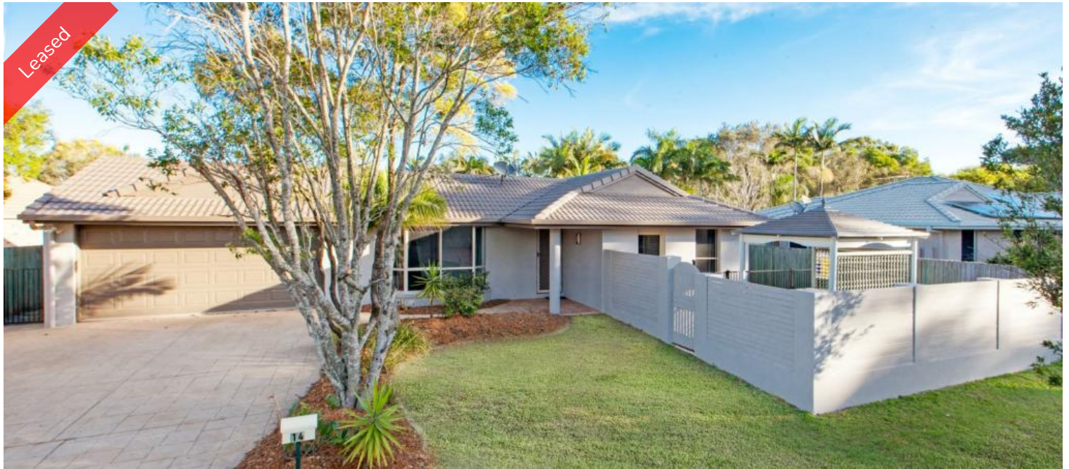
14 Candlebark Court , Mountain Creek