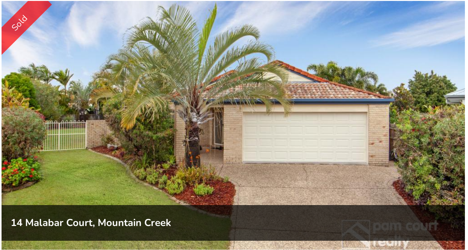
14 Malabar Court, Mountain Creek