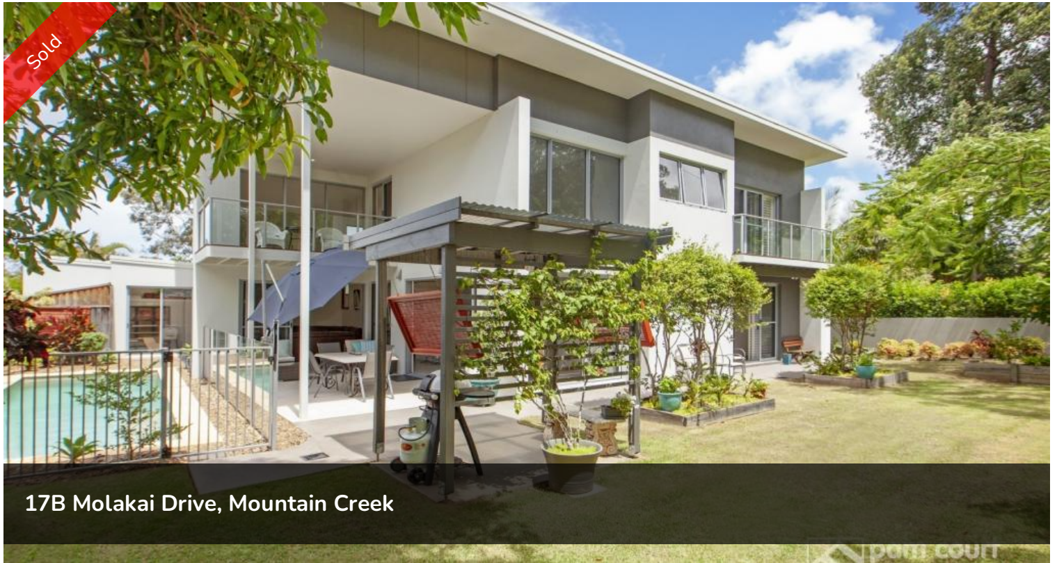
17B Molakai Drive, Mountain Creek