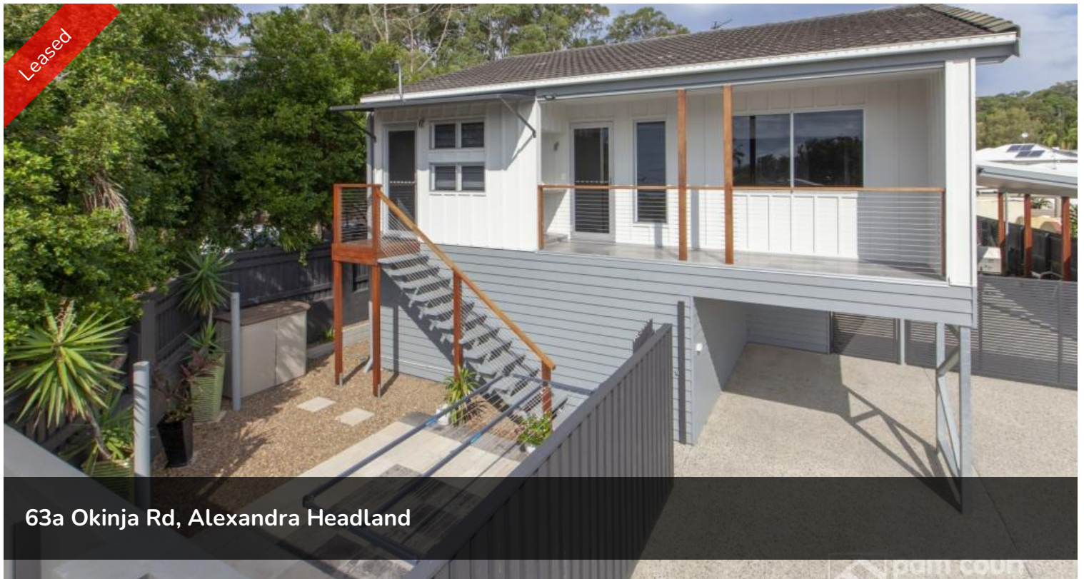
63a Okinja Rd, Alexandra Headland