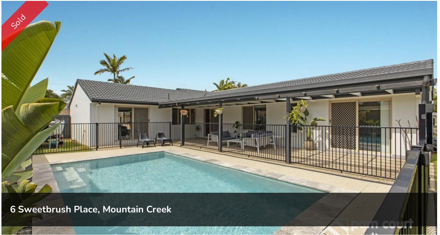
6 Sweetbrush Place, Mountain Creek