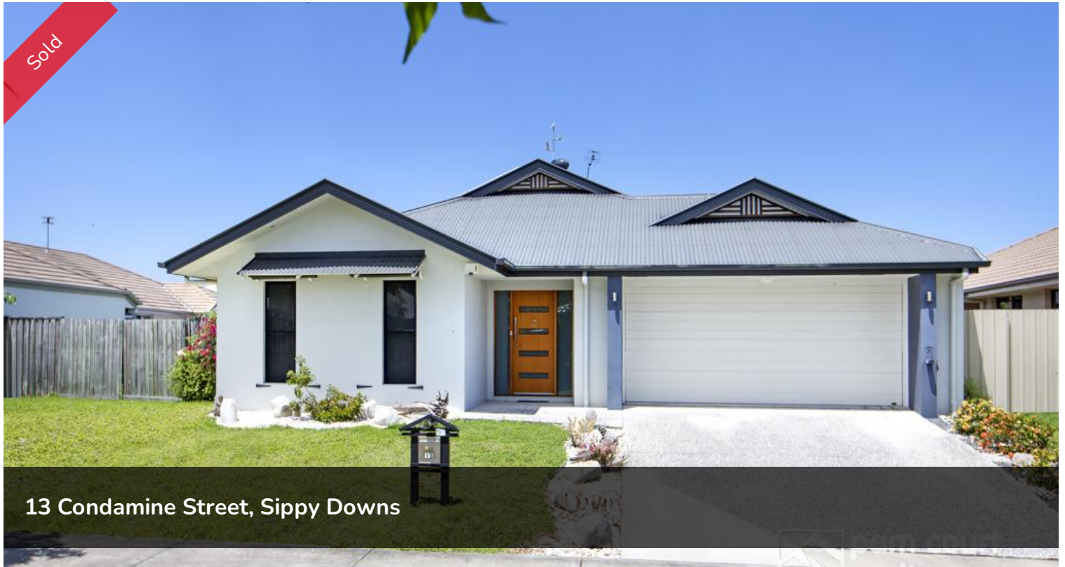
13 Condamine Street, Sippy Downs