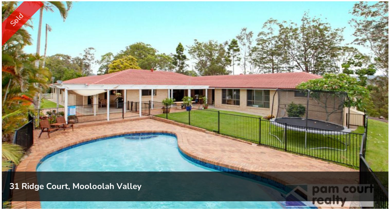
31 Ridge Court, Mooloolah Valley