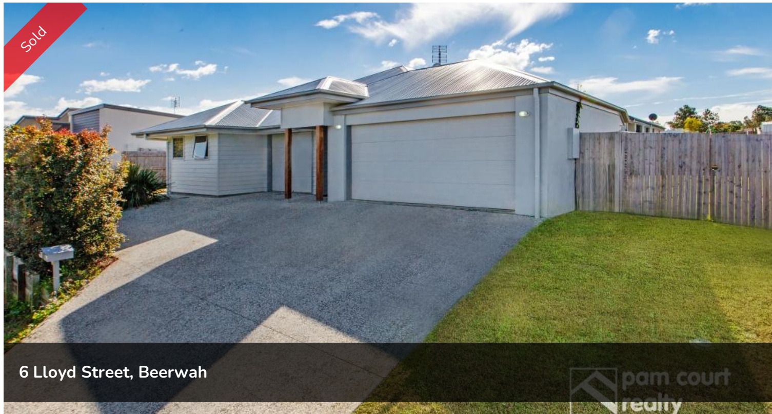
6 Lloyd Street, Beerwah