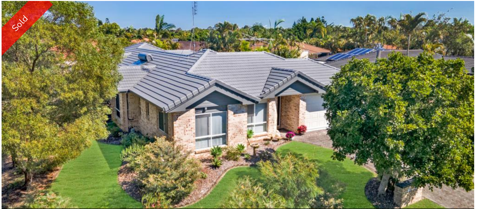
1, 17 Sweetbrush Place, Mountain Creek