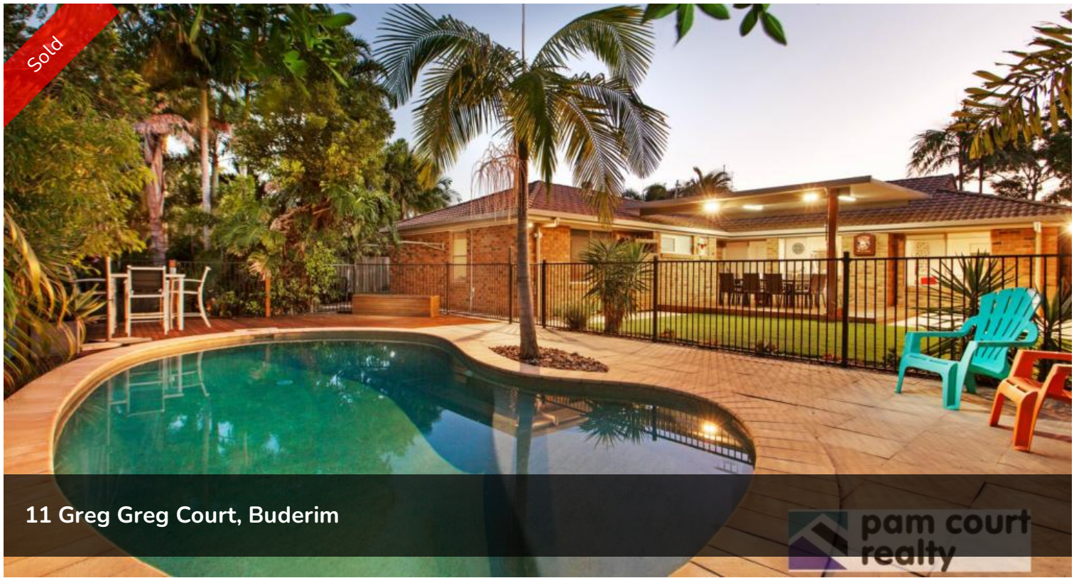
11 Greg Greg Court, Buderim