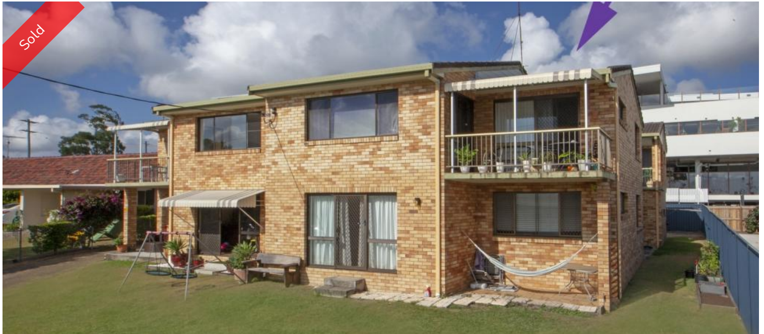
Unit 4, 63 Neerim Drive, Mooloolaba