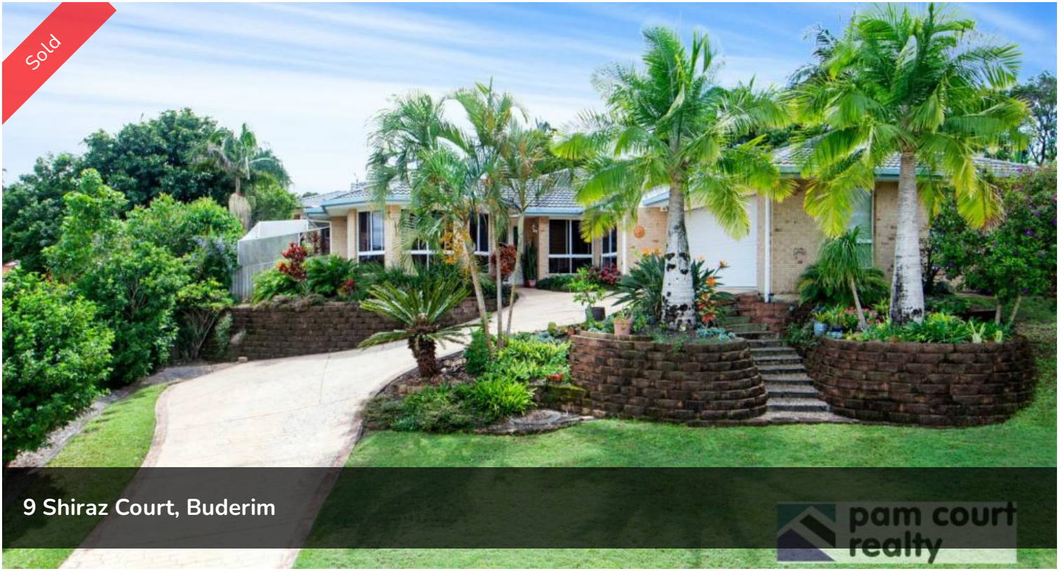
9 Shiraz Court, Buderim