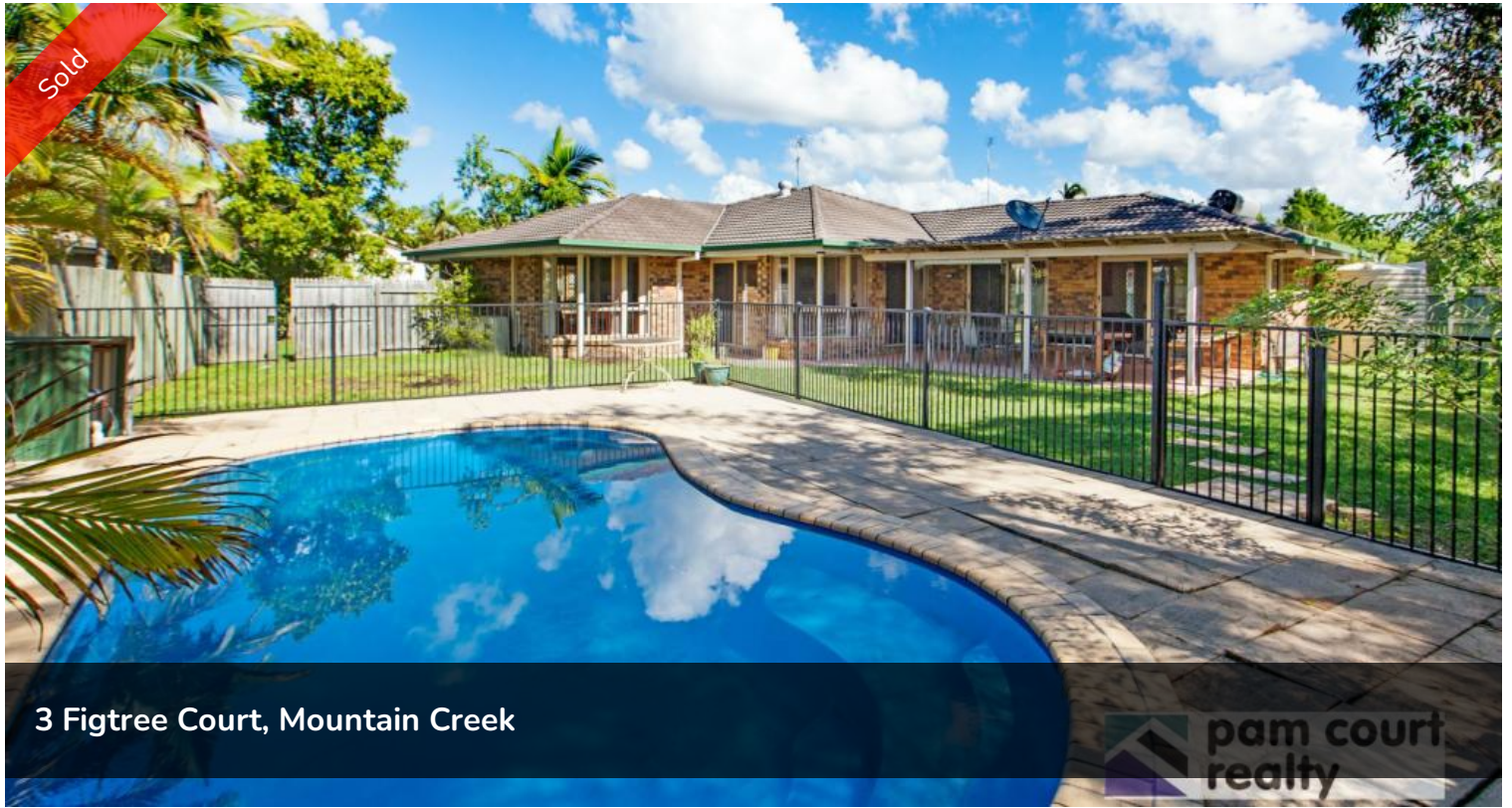
3 Figtree Court, Mountain Creek