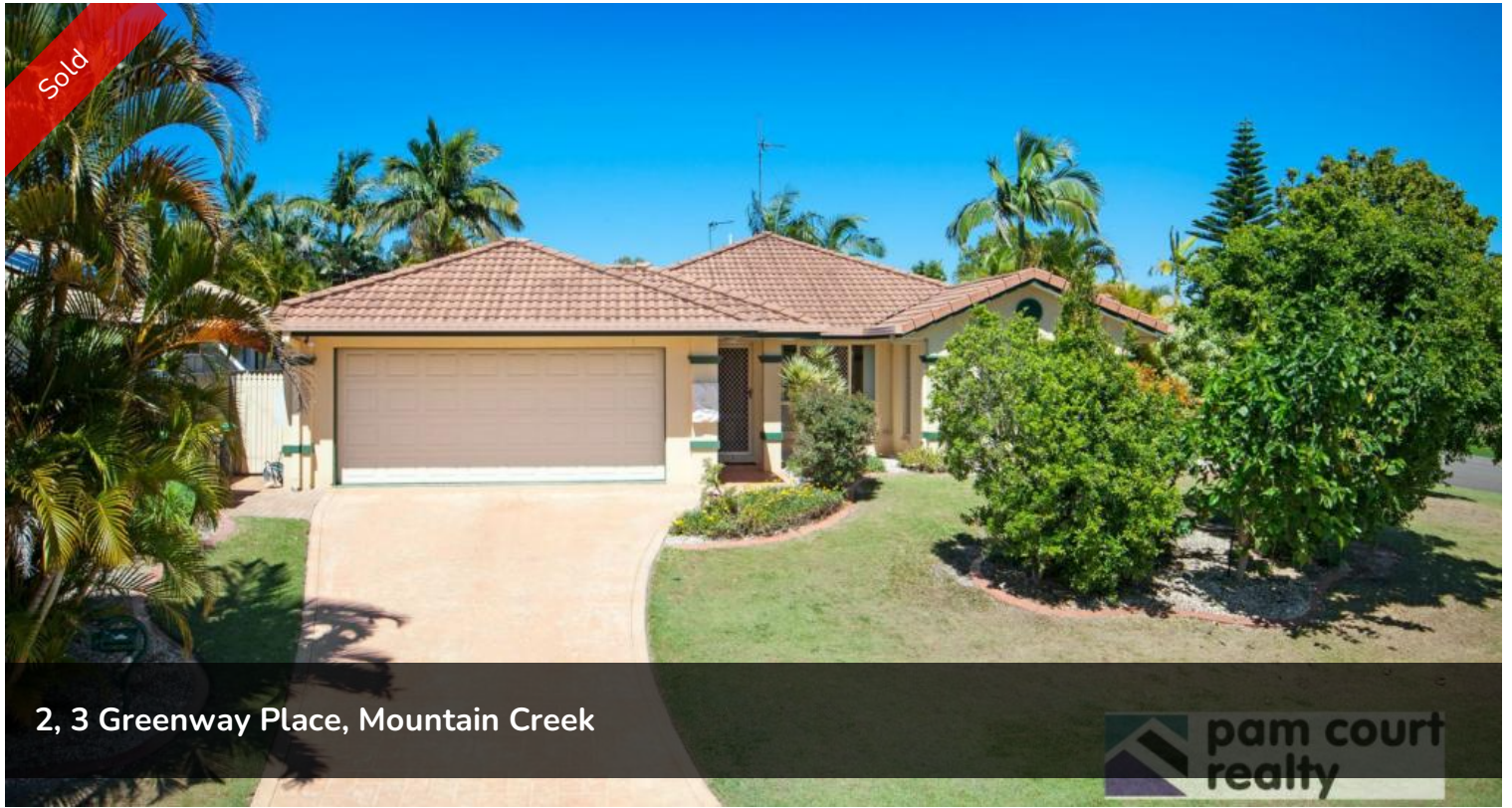
2, 3 Greenway Place, Mountain Creek