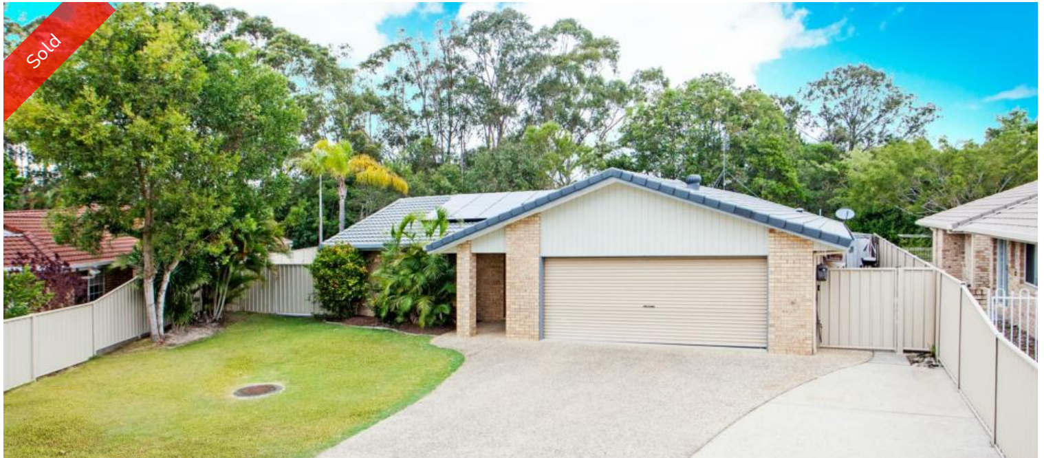
6 Gymea Court, Mountain Creek